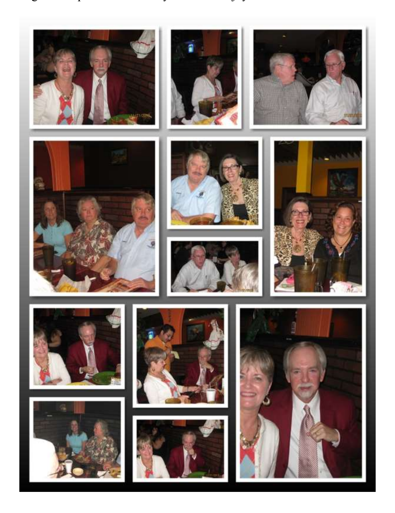
Following are the photos from today's lunch. Enjoy!