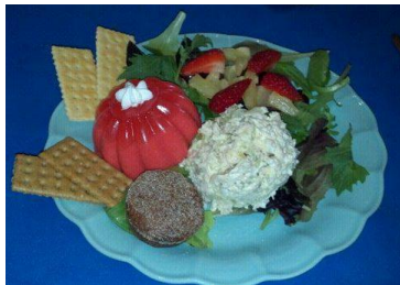
Chicken Salad Plate

This month's DHS70 Lunch was at Mildred's Restaurant & Tea Room. The menu today was Chicken & Dumplings, Sweet Potato Casserole, Baked Ham Slices, Green Beans, and Chive Mashed Potatoes. Some of us ordered the Chicken Salad Plate with Fruit, wonderful homemade mini-muffins and Congealed Salad. Everything was delicious!