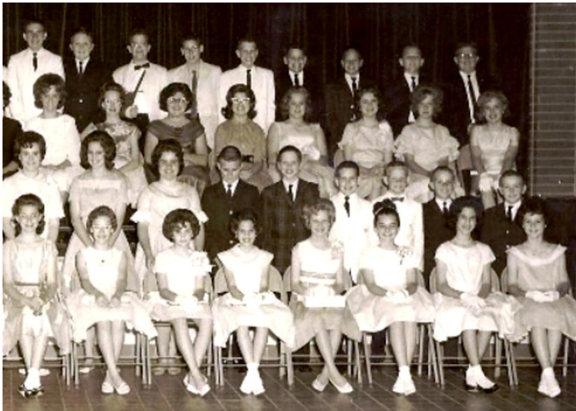
Right side of Selma Street 6 th grade photo