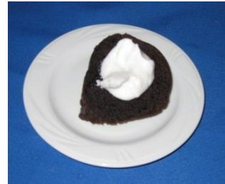
Chocolate Bundt Cake