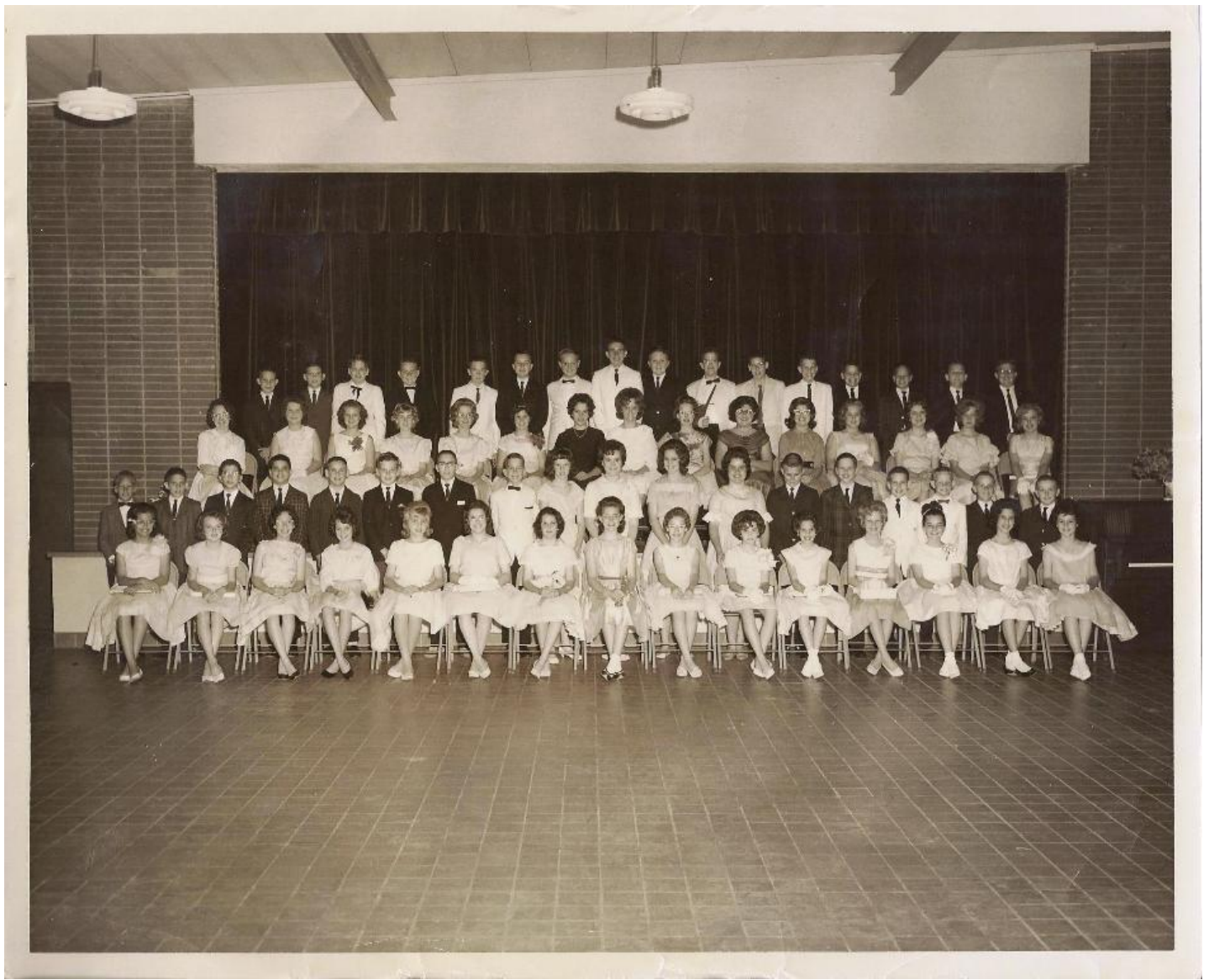
6 th Grade at Selma Street School 1964