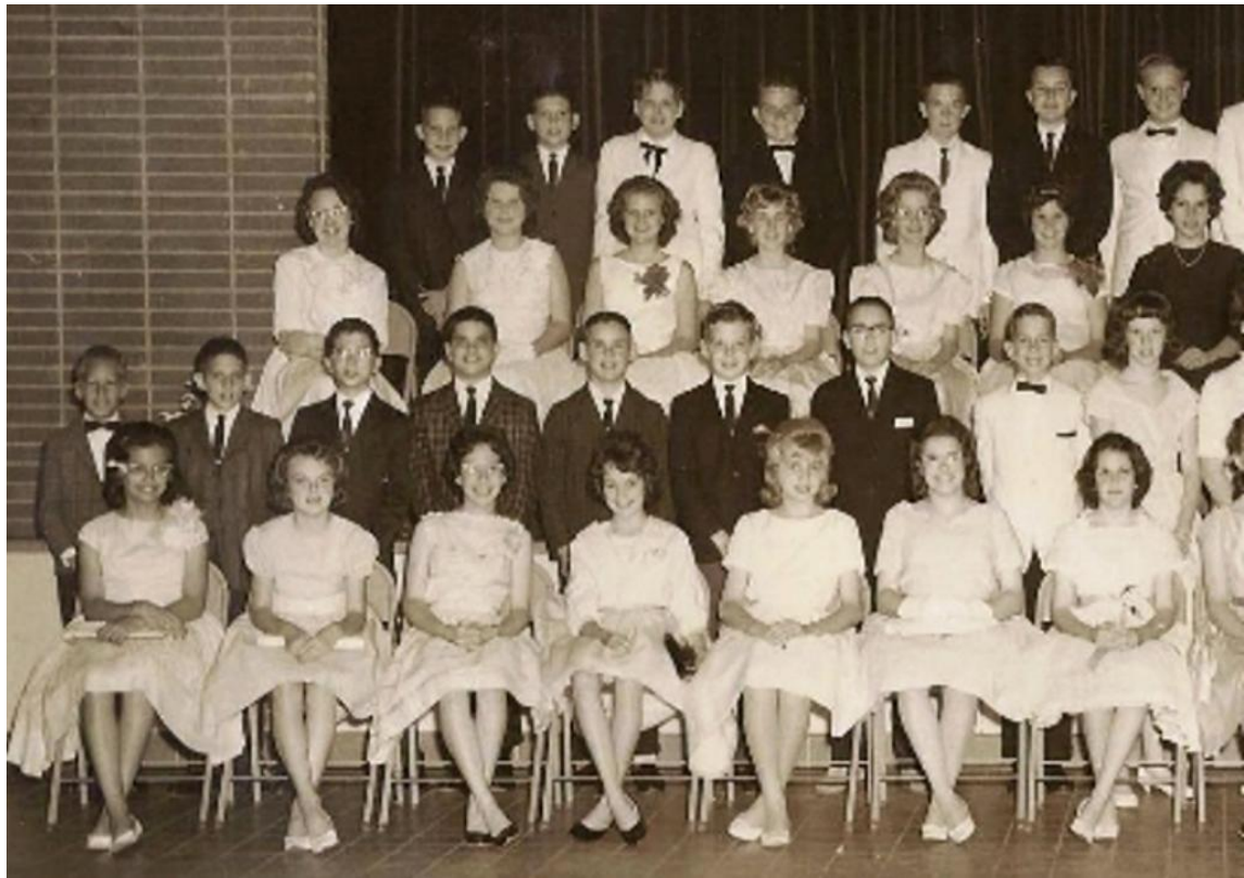
Left side of Selma Street 6 th grade photo