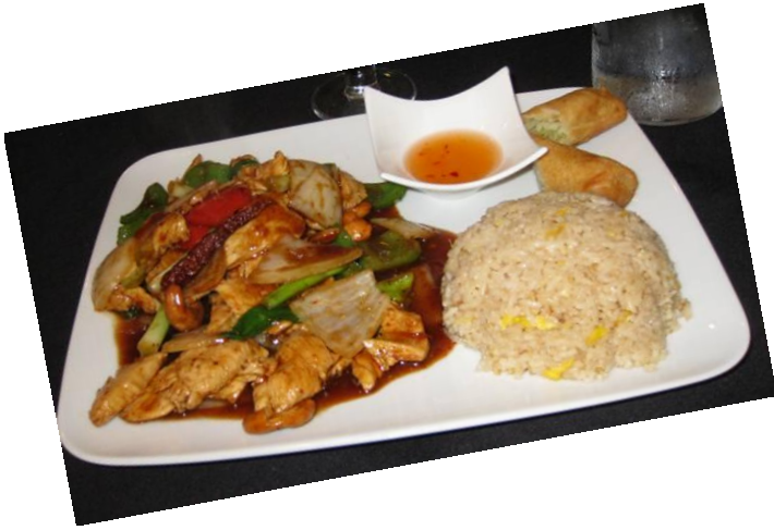
Chicken Fever** - Sautéed Sliced Chicken Breast In Roasted Chili Paste

was delicious! The newcomers to Thai Cuisine really enjoyed the food and said they would be returning again.