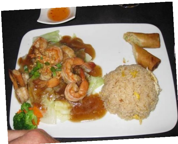
Shrimp Garlic - Sautéed Shrimp With Steamed Veggies In Garlic Sauce